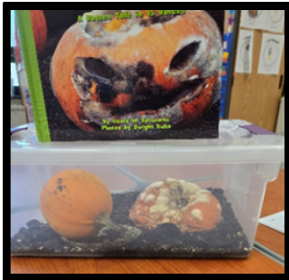
Pumpkin Ag in a Box

At the Middlesex County Fair, one of NJ's largest, NJAITC and NJFB conducted community outreach featuring membership info, giveaways, and the NJ Ag in a Box program. The showcase led several educators to purchase kits for their classrooms or districts.