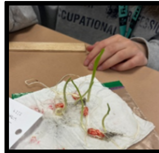
Experiential Education Underway!