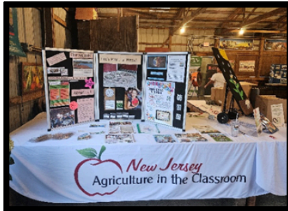
NJ Ag in the Classroom Table