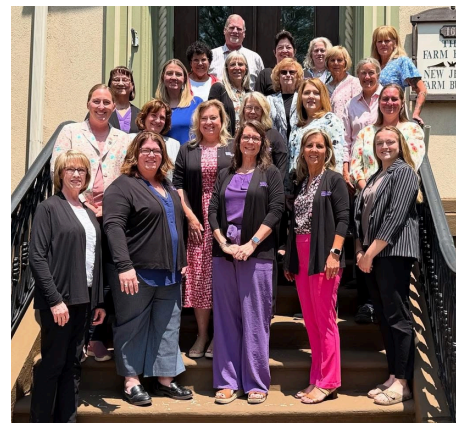
2025 AFBF National Women's Committee meeting