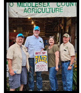
County Fair Outreach