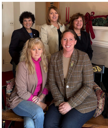
NJFB Executive Committee